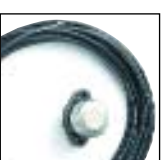
RMN4856 Footswitch with Remote PTT