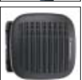
RSNM4001 External Speaker