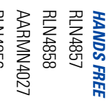
RLN4857 Pushbutton with remote PTT