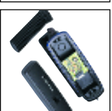
ALN6873 Remote Mount Kit