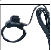
PTT RLN4857 Pushbutton with Remote (cables not shown)