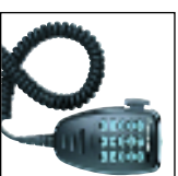
AARMN4026 Enhanced Keypad Mic

Chances are, you are going to be doing a lot of talking on the road. Keep yourself safe, with a host of Motorola accessories that allow you to concentrate on tackling traffic conditions.